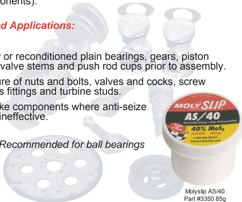
Molyslip AS/40 Part #3350 85g